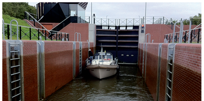
Inside the lock chamber of the Kanaal Erica-Ter Apel.

FRP cannot rot or corrode, it is resistant to moisture, salt and UV-radiation, and does not decay over time. This makes the structure also in the long term safer than all alternatives.