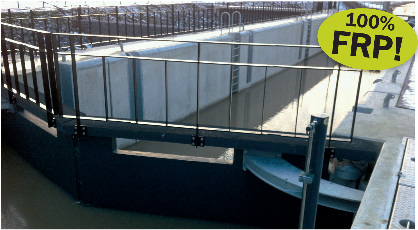
InfraCore® Inside FRP lock gates in Kanaal Erica-Ter Apel.

InfraCore® Inside is FiberCore Europe's proprietary technology to construct strong, lightweight and durable structures in fiber reinforced polymers (FRP, or composites). FRP is a proven technology, with significant advantages to steel, concrete and timber in lock gates, flood gates and other marine structures: