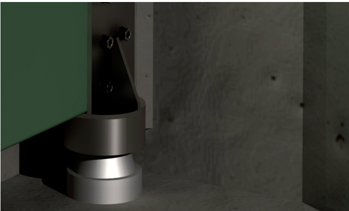
Connection lock gate to lower hinge.

For more information please visit our website or contact us: